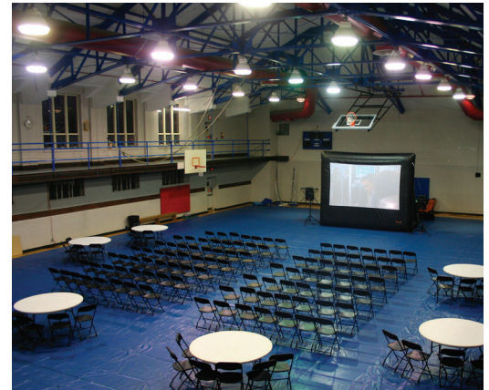
All Rights Reserved. Southern Outdoor Cinema

Only a Movie Licensing USA Site License provides coverage for: